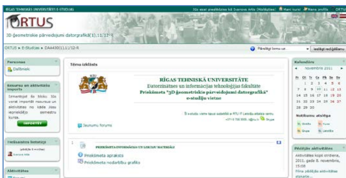
Fig. 3. Design of study subject

In the beginning of each term, every subject gets new empty e-learning course on Moodle. Students and teachers are automatically enrolled to their courses, according to data entered in student record management system. Teachers can import their courses from previous years and choose which study resources are needed for new term. It is possible to add new materials at any time. Each study subject has its own e-course, where one can always find a description of learning objectives and subject schedule. This information is placed as set of hyperlinks and is visible once course is generated (Figure 3).